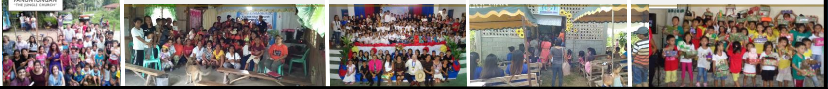
BANGKAL OCEAN PENAPLATA PANUNTUNGAN THE JUNGLE CHURCH