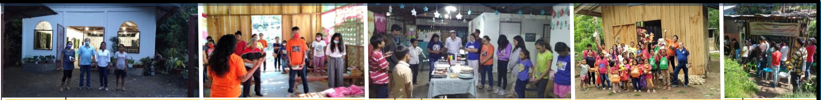
TACUNAN Church SION Church FATHER'S HOUSE BANDERA Church COMMUNAL

When kids enroll at BCA, their families often turn to Jesus. We plant churches in their areas: in homes, under trees & other buildings...some still under construction! The distance our pickup truck drives to our farthest churches is 80 miles. Parishioners total around 1,200. American pastors this year will preach at half a dozen churches.