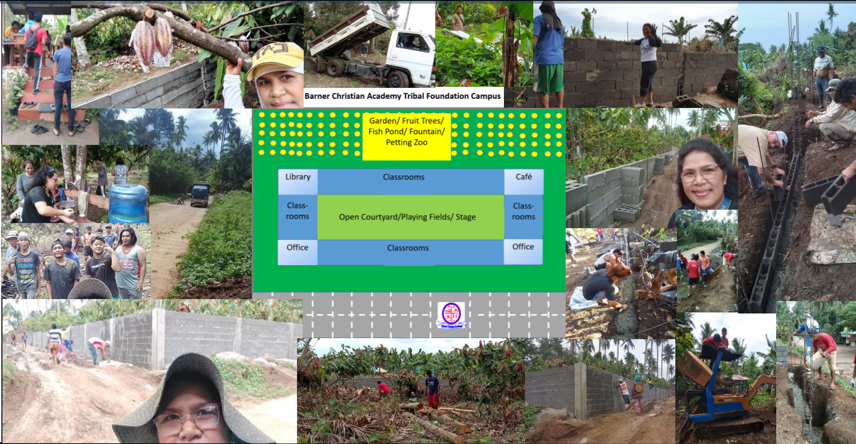
Barner Christian Academy Tribal Foundation Campus

The workers themselves daily begin their workday with a Bible study & singing by their supervisor who is nicknamed by neighbors: "the preacher man" .