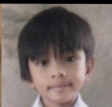
Melb Hinobiagon Birthday 3/30/14 2 nd Grade