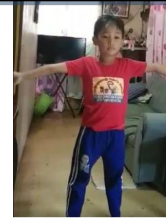
For gym credits, choreography builds the students' muscle tone.