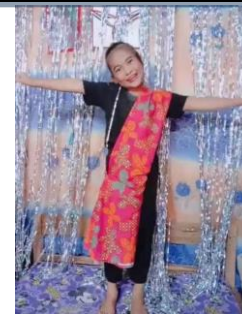
Dances & costumes preserve legally-binding historical tribal culture.