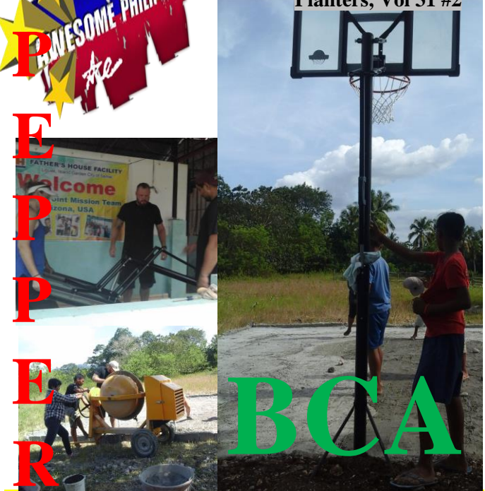
Arizona & Colorado work teams pour cement to build a basketball court at BCA's FHF orphanage.

Paul M Barner Ministries, Inc. Philippine Church Planters, Vol 31 #2