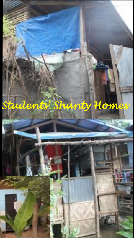
Students' Shanty Homes