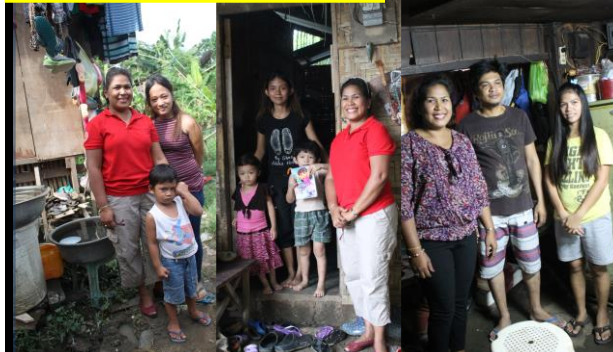
Elvie visits poor families