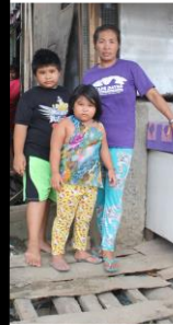
Elvie visits poor families