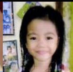
Princess Ale Birthday 11/19/2012 Nursery