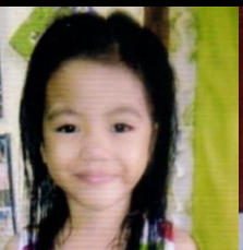
Princess Ale Birthday 11/19/2012 Nursery