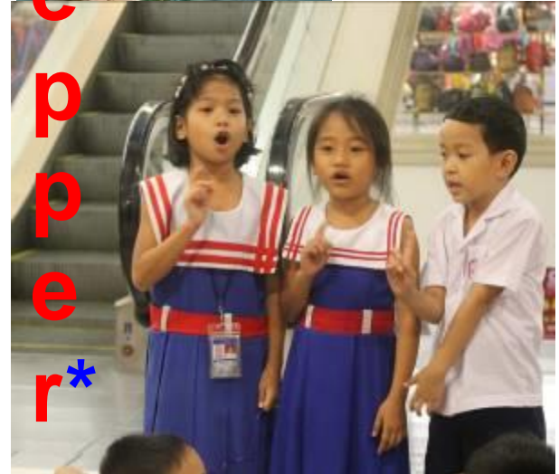
BCA students sing Gospel songs in a shopping mall while fitting for shoes.