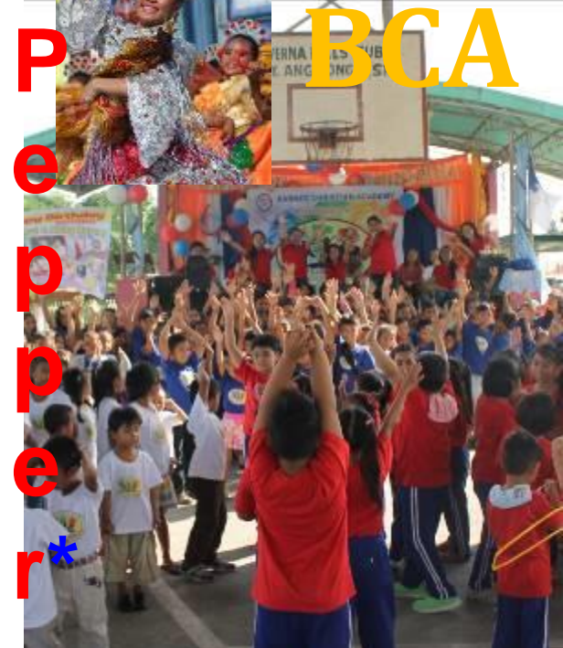
BCA's 19th Foundation Day: Hundreds of Filipino students praising God!