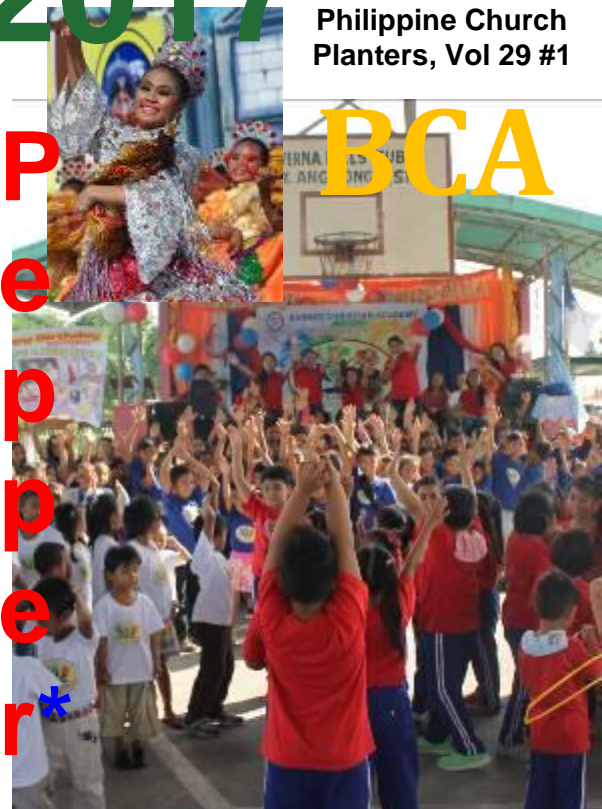
BCA's 19th Foundation Day: Hundreds of Filipino students praising God!