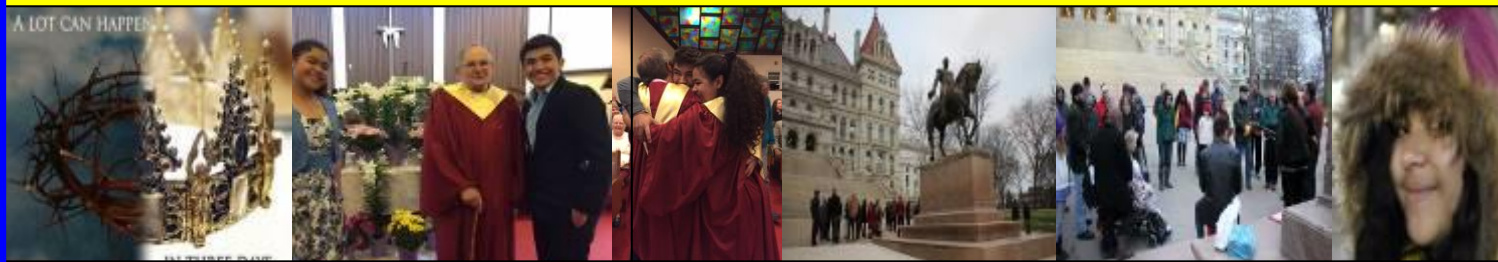
At 4:30am Easter Sunday, we rushed to the Albany, NY State Capitol building in the blistery chill & joined 6 other churches to pray.