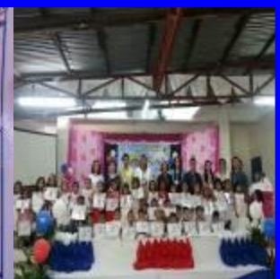
Barner Christian Academy celebrates "Batch 2016" Eighteenth annual Graduation, Commencement & Moving-Up Ceremonies!