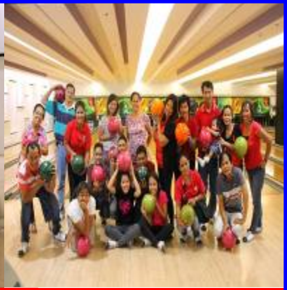
On Barner Christian Academy's Teacher's Appreciation Day, after a Bible message the parents & students performed & lined up to give gifts to their teachers. Then the school treated the staff to bowling & dinner.