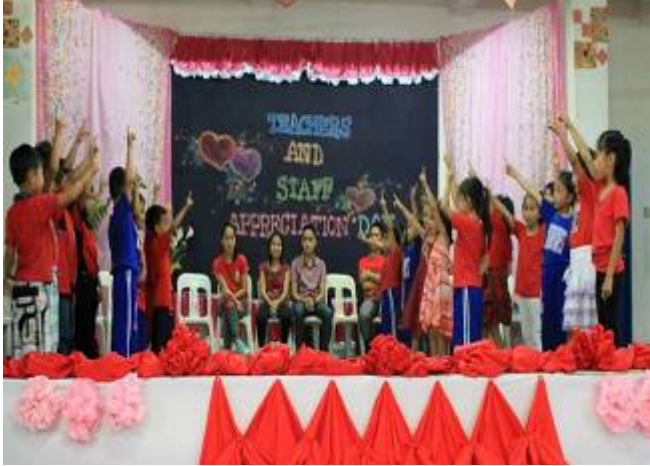
On Valentine's Day, the students perform for BCA's 20 faculty on Teachers & Staff Appreciation Day