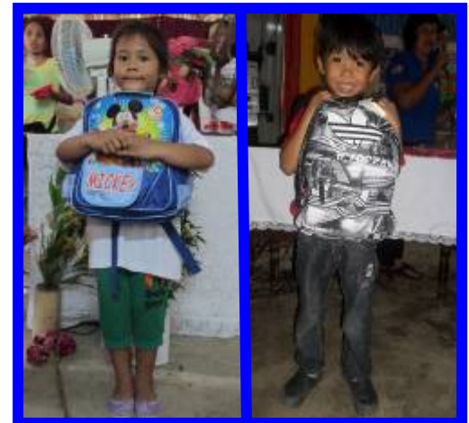
Donors in four countries gave so 500 BCA students could have full backpacks for Christmas, 2014.

Paul M. Barner Ministries Philippine Church Planters Vol 27 No 3