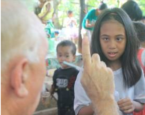
Barner Christian Academy provides ten medical screening outreaches throughout Davao City during the visit of two American doctors.