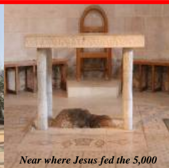
Near where Jesus fed the 5,000