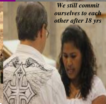
We still commit ourselves to each other after 18 yrs