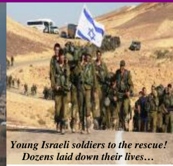
Young Israeli soldiers to the rescue! Dozens laid down their lives...