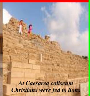
At Caesarea coliseum Christians were fed to lions