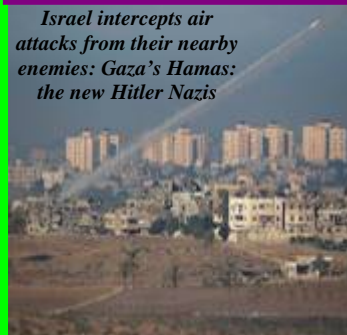
Israel intercepts air attacks from their nearby enemies: Gaza's Hamas: the new Hitler Nazis

Visited 5,000 yr old archeological dig (Gezer). Elvie & I renewed marriage vows @ Cana.