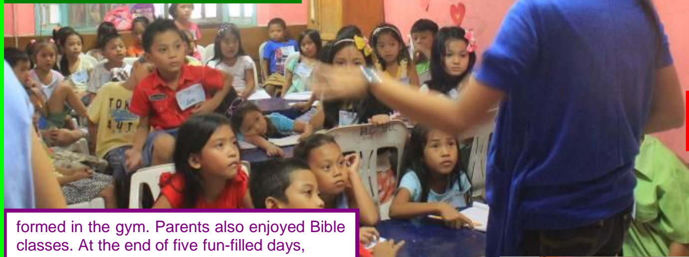
formed in the gym. Parents also enjoyed Bible classes. At the end of five fun-filled days,