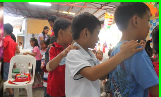
Barner Christian Academy's 2014 Vacation Bible School brought over 400 children from all walks of life in Davao City. With the theme "Turned Around," BCA's seven buses emptied load after load of kids, who often were registered by their parents. Signs led each child to