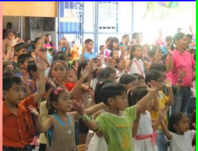
Each student received his/her diploma. 27 children prayed to become believers!