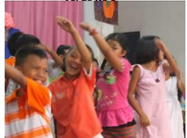
Hundreds of students at Barner Christian Academy enjoy the daily performances they give during their 2014 Vacation Bible School themed "Turn Around"

Paul M. Barner Ministries Philippine Church Planters Vol 26 No 6