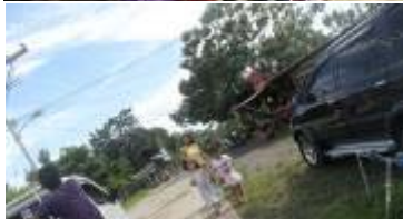
KIDS FROM CHURCH GAVE THE CARDS AWAY

of our walls let in the cold air at night. The posters keep us warm.”