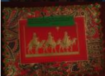
FRIENDS SENT US CARDS WITH BIBLE VERSES.