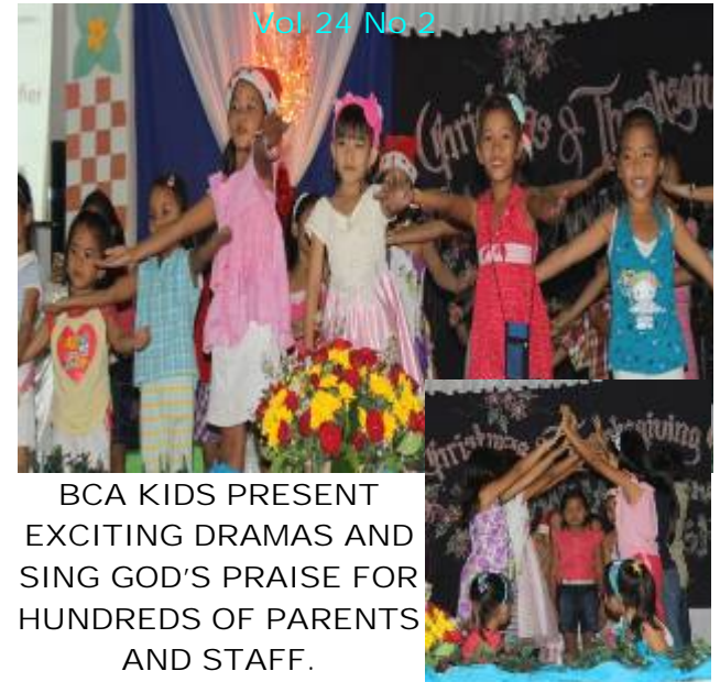
BCA KIDS PRESENT EXCITING DRAMAS AND SING GOD'S PRAISE FOR HUNDREDS OF PARENTS AND STAFF.

Paul M. Barner Ministries Philippine Church Planters