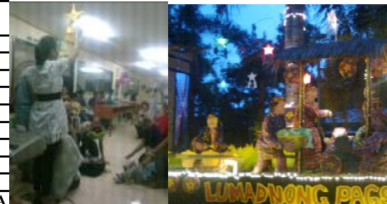
PHILIPPINE-STYLE CHRISTMAS: AT OUR SEMINARY PARTY, ALL THE NATIVITY ROLES ARE PLAYED...EVEN THE STAR! AT THE PARK, THE WISE MEN BRING GIFTS OF FISH, FRUIT AND WILD BOAR!