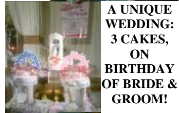
A UNIQUE WEDDING: 3 CAKES, ON BIRTHDAY OF BRIDE & GROOM!