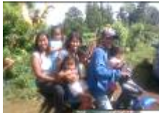
7 ON ONE MOTOR- CYCLE!