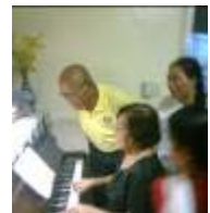
OUR PASTORS JOIN KIWANIS CHRISTMAS CAROLLING