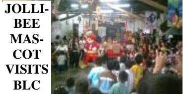
JOLLI- BEE MAS- COT VISITS BLC