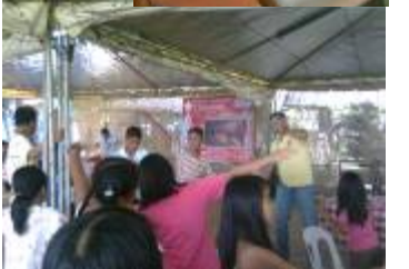
40 FROM BLC'S SWIM TEAM JOIN KIWANIS' DIVISION PARTY.