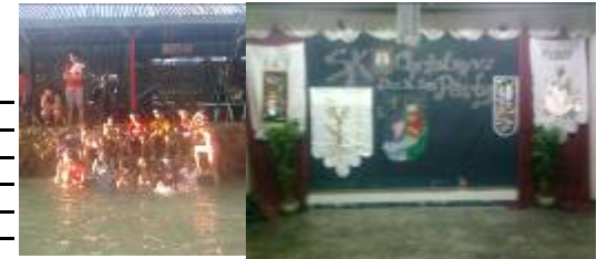
BLC'S SWIM TEAM PRACTICES EVERY SATURDAY IN THE PACIFIC OCEAN FROM 5-7AM, PREPARING FOR THE MAY KIDDIE TRIATHLON. SOMETIMES THEY TAKE PARTY BREAKS!