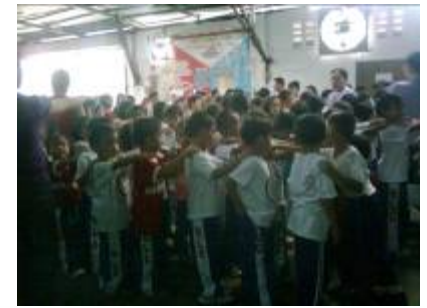
500 BLC KIDS LEARN TEAMWORK FROM STAFF & YOU.