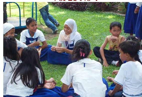
10 BLC KIDS TEACH NEW GAMES TO 46 MUSLIM KIDS IN THE MINDANAO CHILDREN'S PEACE INITIATIVE.