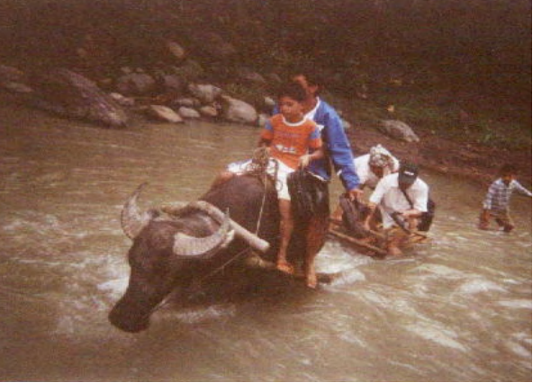
POOR TRIBAL FAMILIES OFTEN COME DOWN FROM THE MOUNTAINS TO LOOK FOR WORK IN DAVAO CITY.