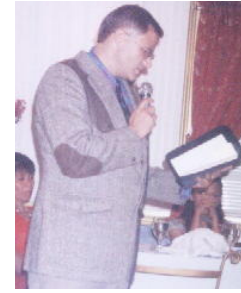
JESUS IS OUR SUPER HERO! DRESSED AS MILD-MANNERED CLARK KENT, I SUDDENLY TRANSFORMED INTO SUPERMAN WHILE GIVING OUR BLC FAC/STAFF CHRISTMAS PARTY