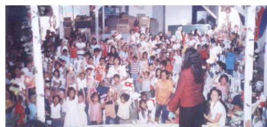
400 BLC KIDS SAY "THANK YOU!"