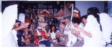
(RIGHT) WITH NO BABY AS JESUS, A BLC KID LAYS ON THE FLOOR.