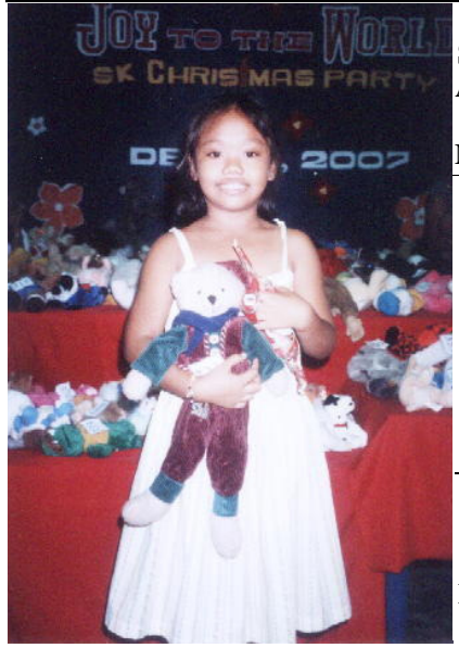
A BLC GIRL CUDDLES HER "NEW" TOY.

TALLY FOR CHRISTMAS 2008 STUFFED ANIMAL GIVEAWAY: 500 NEEDED/ 0 RECEIVED