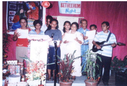
OUR PANANTONGAN CHURCH PLANT'S CHOIR SINGS CAROLS DURING THEIR 2007 CELEBRATION. THEIR THEME: "ONE BETHLEHEM NIGHT..."

The location is a few hours away, in the cool climate of Mount Apo. BLC will also start a native school, via our child sponsorship program, to give a quality Christian education to both the tribal and delinquent kids. The makeshift houses will be built by our BLC parents. Each will use his or her specific gifts to build with native products of coconut leaves and bamboo. Pls. pray.