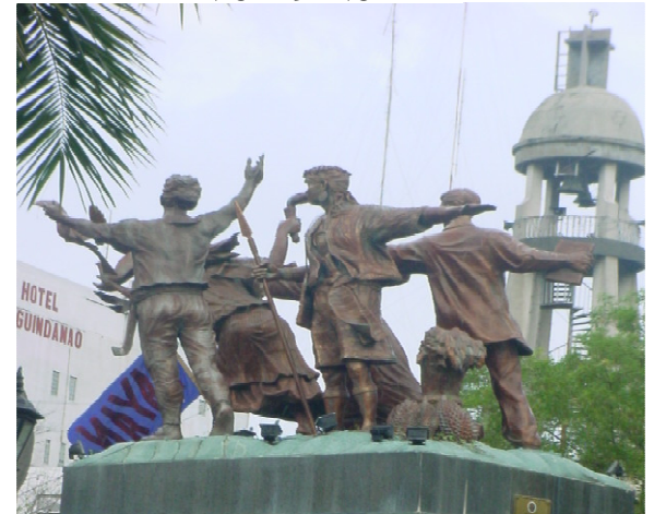
A STATUE IN DAVAO CITY: FOUR PEOPLES, TRIBAL, MUSLIM, CATHOLIC, PROTESTANT