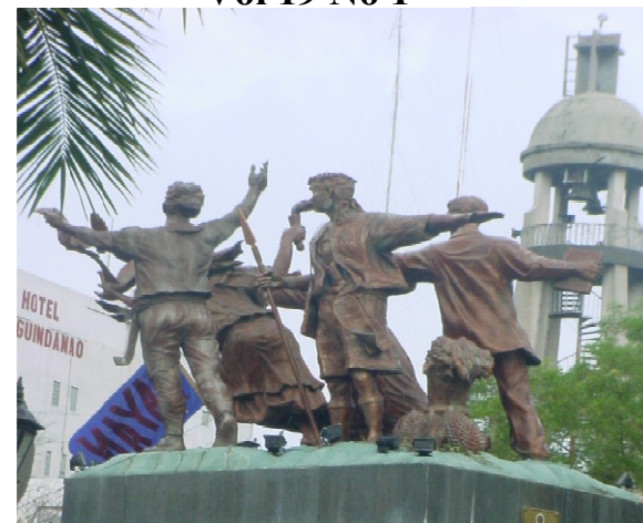
A STATUE IN DAVAO CITY: FOUR PEOPLES, TRIBAL, MUSLIM, CATHOLIC, PROTESTANT

Paul M. Barner Ministries Philippine Church Planters Vol 19 No 1