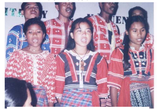
TRIBAL BELIEVERS COMPETE IN A PROVINCEWIDE PRAISE CONTEST, WEARING TRADITIONAL COSTUMES.