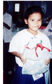
A SMILING BLC CHILD RECEIVES A GIFT FROM HER SPONSOR.