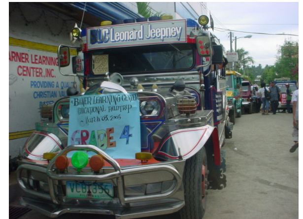
THE BARNER LEARNING CENTER JEEPNEY AND MULTICAB-BUSES LOAD UP WITH CHILDREN FOR OUR ANNUAL FIELD TRIP.

Paul M. Barner Ministries Philippine Church Planters Vol. 18, No. 3