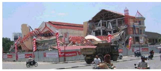
A SHOPPING MALL IN BANDA ACEH, INDONESIA WAS FLATTENED BY THE EARTHQUAKE ON 12/26.

International BLC Sponsorships (801-BLC) The BLC (Barner Learning Center) International Student Sponsorship Program is an opportunity for Filipino children who otherwise might not be able to afford a quality Christian education to obtain schooling at no cost to their families through the "adoption" of their financial schooling obligations by international supporters. For support of those at ages 2 through 15, the fee is $20 (P1000) per month. Each Sponsorship covers the following: tuition, enrollment, books, uniform, registration, dental checkup, insurance, medical checkup, ID card/jacket, instructional materials, PTA & library & campus fees, school publications, graduation fee & gown, yearbook, field trip transportation costs, boy/girl scout membership & uniforms, gym fee, and basic school supplies (notebooks, pencils, etc.). Please send to Christian Aid Mission (address below)