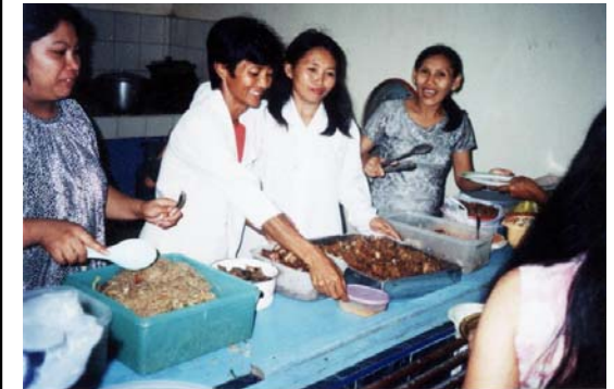
Children are served from the new BLC Kitchen.

A SNEAK PEEK INTO SOME DIARIES OF BLC'S TEACHERS & STAFF, IN DAILY NOTEBOOKS SUBMITTED TO PRESIDENT PAUL, ENTITLED, “THE CAPTAIN'S LOG”