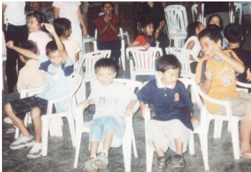
Musical chairs for BLC kids on Gym Day.

“I followed up the engineer to allow some of the poor families’ fathers to work on BLC’s construction for our new building. Many of these people are my neighbors in the poor area.”