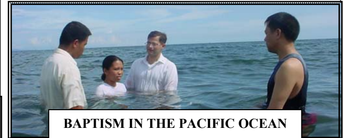
BAPTISM IN THE PACIFIC OCEAN