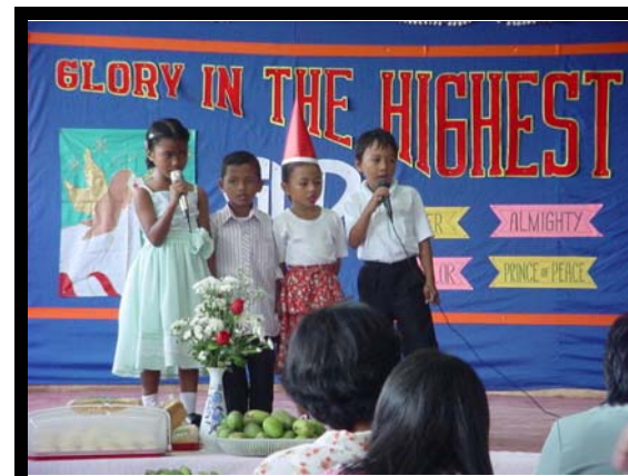
A KIDS' CHRISTMAS QUARTET DURING OUR 60-PUPIL CHURCH PRESENTATION.